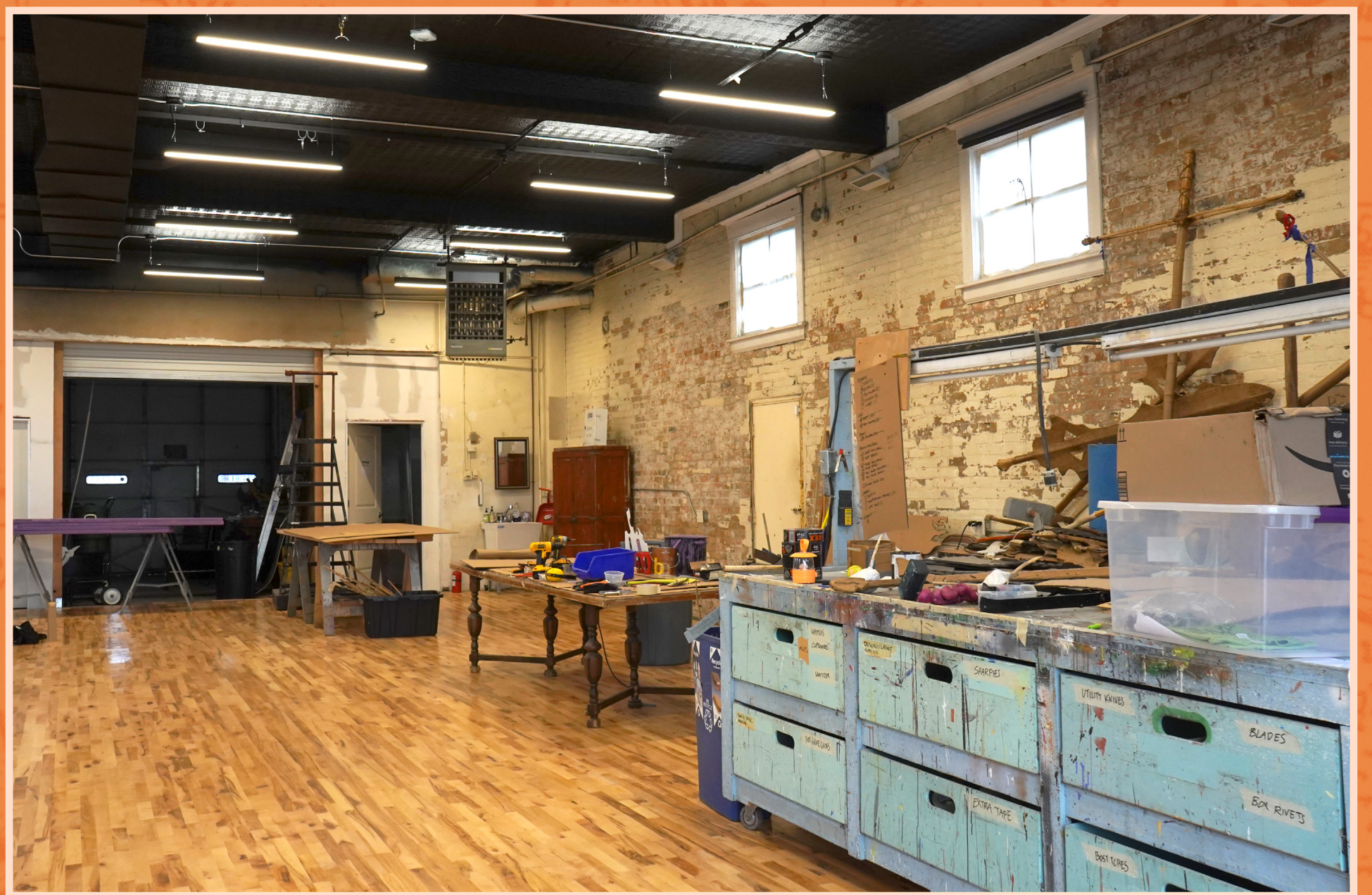
Interior of Fire Station 24 in 2022.

Where else do you see the legacy of segregation in Minneapolis?